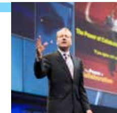
John Chambers CEO Cisco