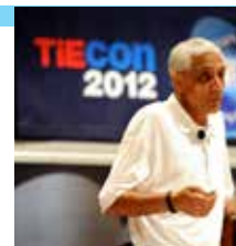
Vinod Khosla Founder Khosla Ventures