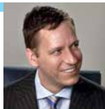
Peter Thiel Founder Paypal