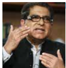
Deepak Chopra Founder Chopra Foundation

4600+ decision makers and technology professionals in attendance attracts the greatest minds in technology and business to speak at TiEcon