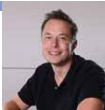
Elon Musk CEO Tesla