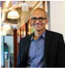
Satya Nadella CEO Microsoft