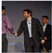
Jeff Weiner CEO LinkedIn