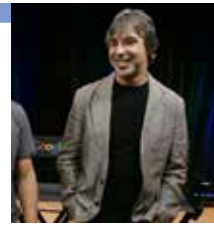
Larry Page Founder/CEO Google