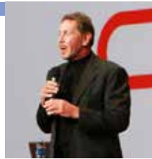
Larry Ellison CEO Oracle