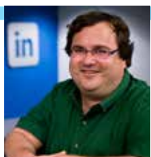
Reid Hoffman Co-Founder LinkedIn