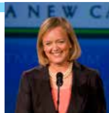
Meg Whitman CEO HP