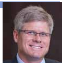
Steve Mollenkopf President & CEO Qualcomm, Inc.