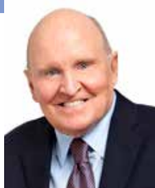
Jack Welch Former CEO GE