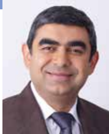
Vishal Sikka CEO & Managing Director Infosys